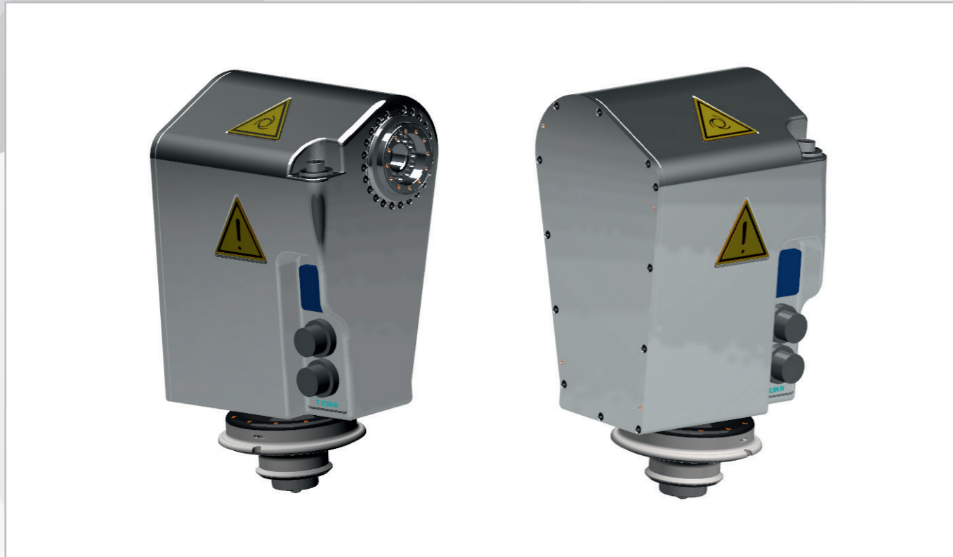
Pan and tilt unit based on the AlopexDrive Actuator